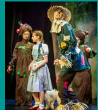
The Wizard of Oz