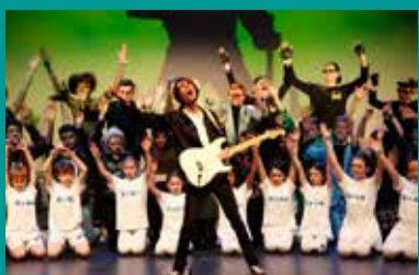
We Will Rock You