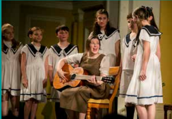
The Sound of Music