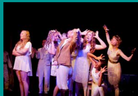
Orpheus in the Underworld