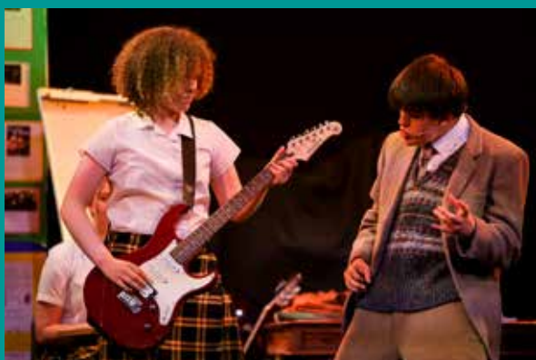
School of Rock