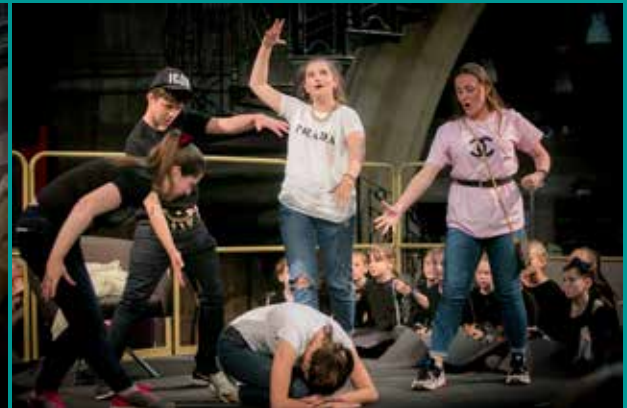
Dido and Aeneas