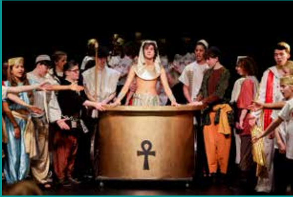
Joseph & The Amazing Technicolor Dreamcoat